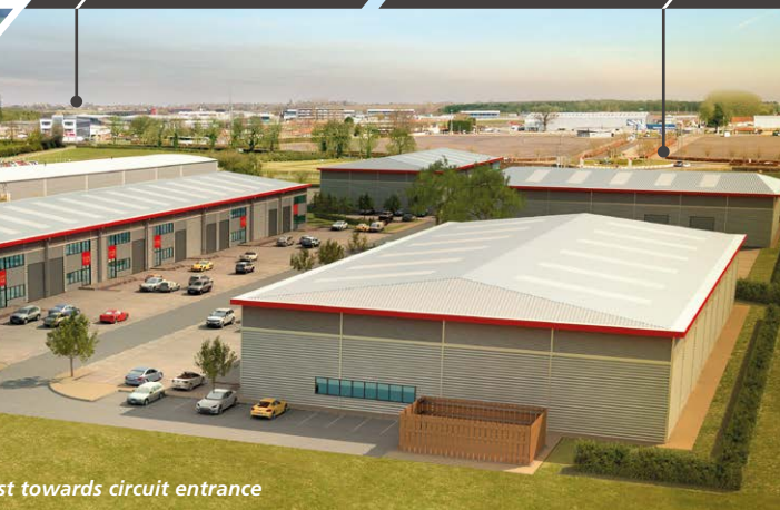
CGI of new development facing East towards circuit entrance

For a viewing and further information, please contact: