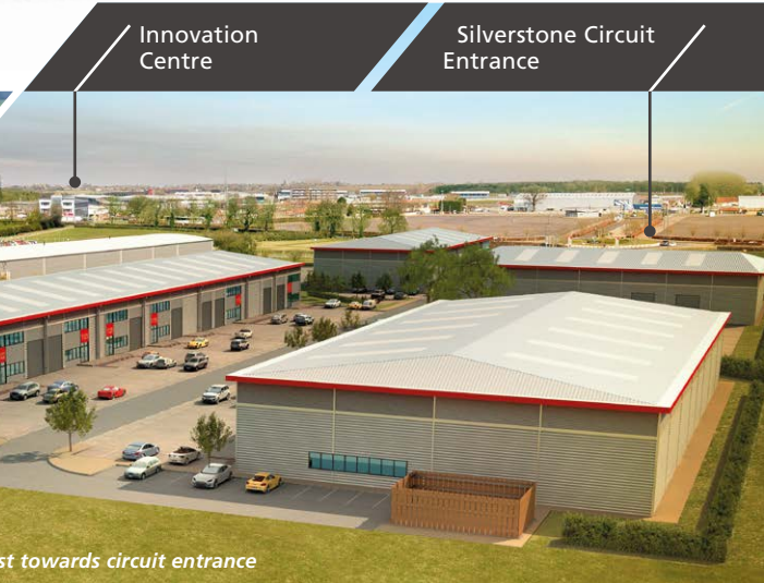
CGI of new development facing East towards circuit entrance

For a viewing and further information, please contact: