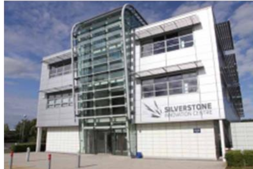
Network of Innovation Centres